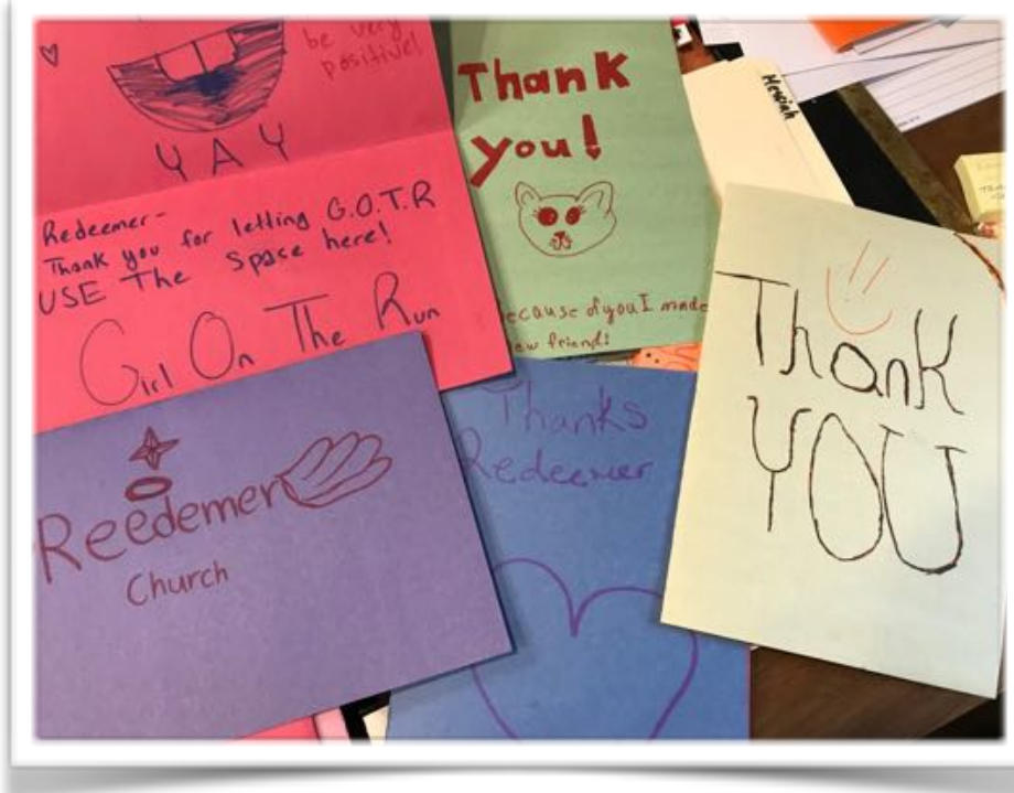
Above: Thank you cards from Girls on the Run. Below: Thanksgiving food boxes for St. Stephan's Grace