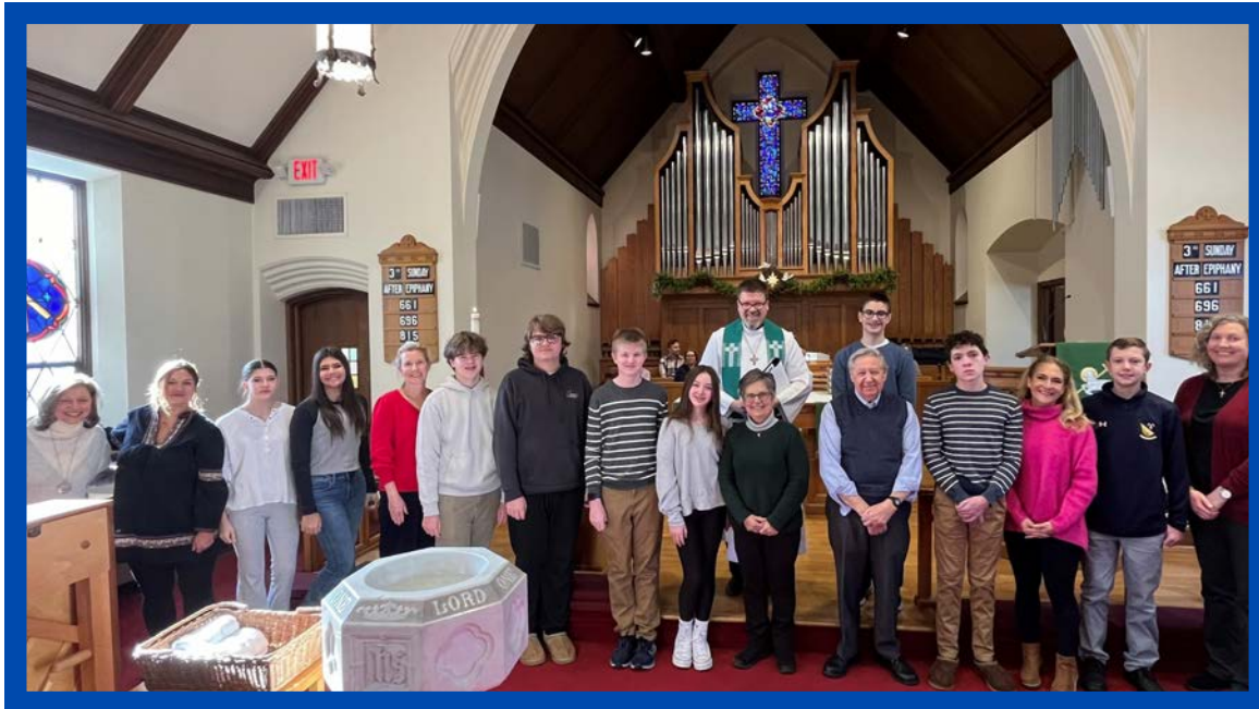
Above, our mentors and confirmation students receive a blessing in worship on Sunday, January 21st.