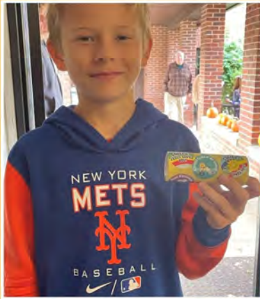
3rd grade secret scrolls