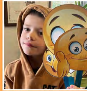
Helping emojis with Pre-k/k class